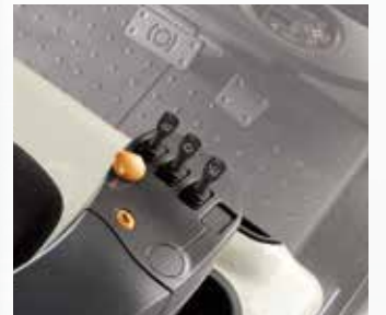
Fingertip Control Levers