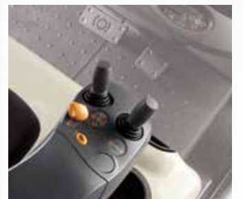
Dual-Axis Control Levers