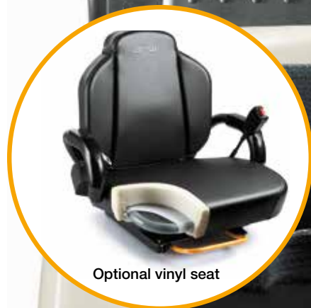
Optional vinyl seat