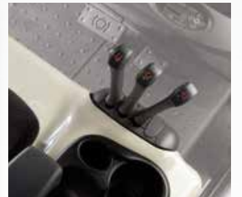
Manual Control Levers