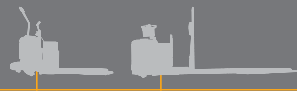
Moves loads like a pallet truck.