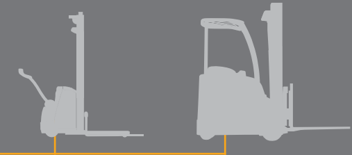
Handles replenishment/retrieval like a stacker/counterbalance truck.