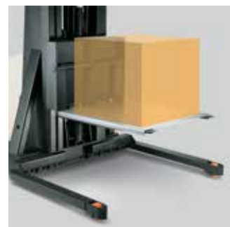
Snap on Platform