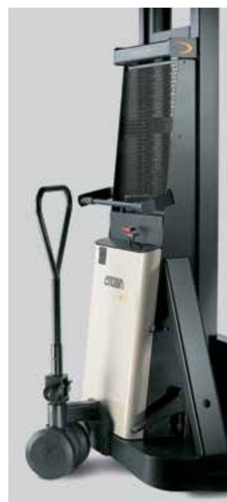
5th Wheel Steering