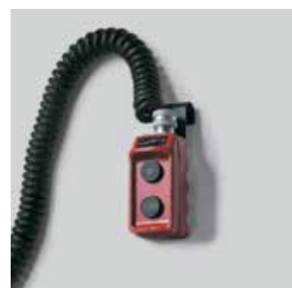
Remote Raise/Lower Control