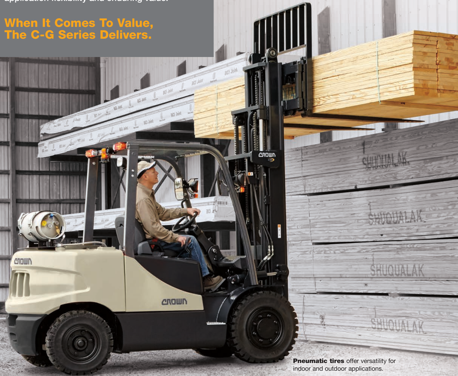
Pneumatic tires offer versatility for indoor and outdoor applications.

When It Comes To Value, The C-G Series Delivers.