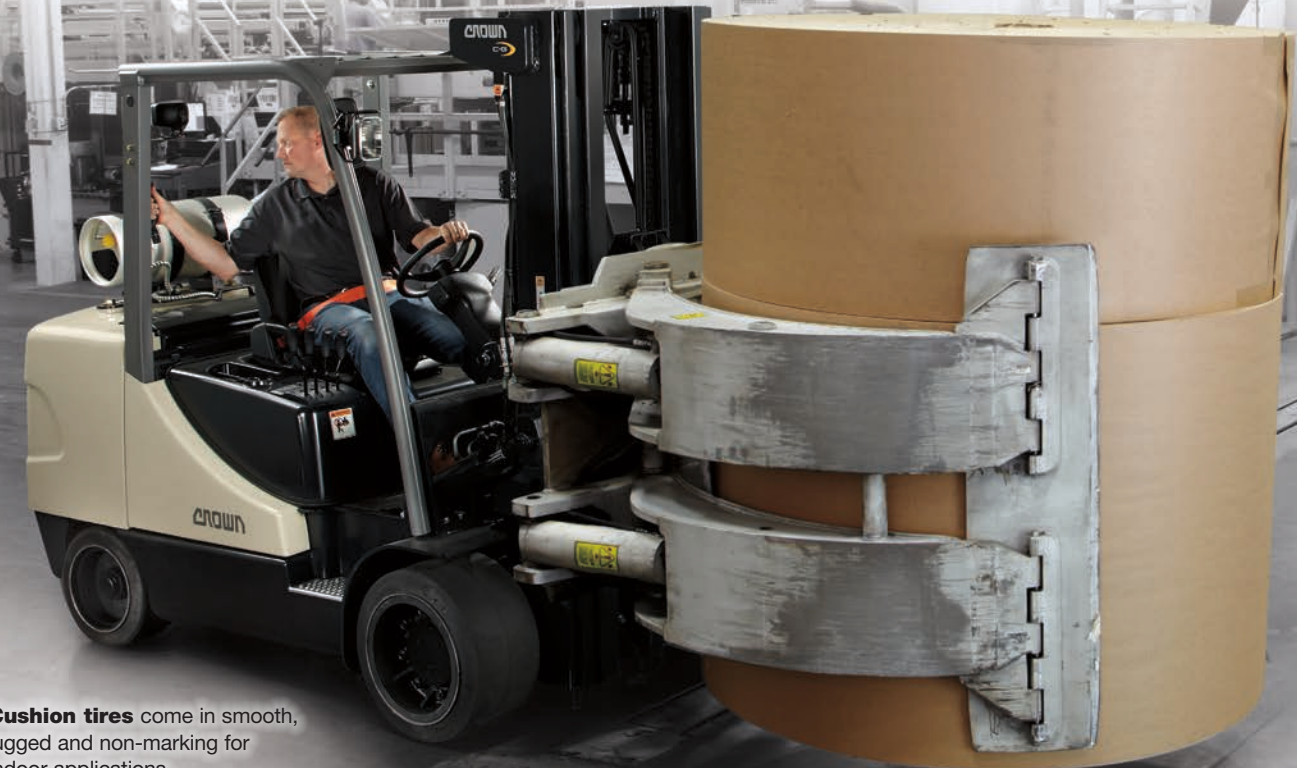
Cushion tires come in smooth, lugged and non-marking for indoor applications.

The Crown C-G Series models blend strength, durability and flexibility to satisfy a variety of application requirements. Its wide range of standard and optional product features are designed to excel in virtually any material handling environment.